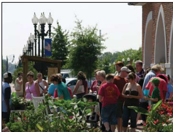
Residents and visitors enjoyed a great selection of plants, hand-made crafts and live entertainment at the first Market Square Days held May 27, 2006.

Managed a year-long satellite exhibition site at Throckmorton Library on Ft. Bragg – 175,000+ attendance Served on the Convention and Visitors Bureau's Cultural Heritage Committee and other Cultural Tourism committees Served on HomegrownHandmade.com Trail Committee for our region Served on various committees for the Base Realignment and Closure project Served on the Fayetteville Litter Initiative Committee Coordinated and supported art for the Mayor's office Served on committees for the Main Street Program Served on Metrovisions Committee for Arts and Recreation Served on Festival Park Development Team Served on Festival Park Management Team Supported Downtown Alliance meetings and activities Served on Cumberland County Library's Assessment Committee Provided fees for costumes for City of Fayetteville and Cumberland County special events Provided Support to the Interagency Council