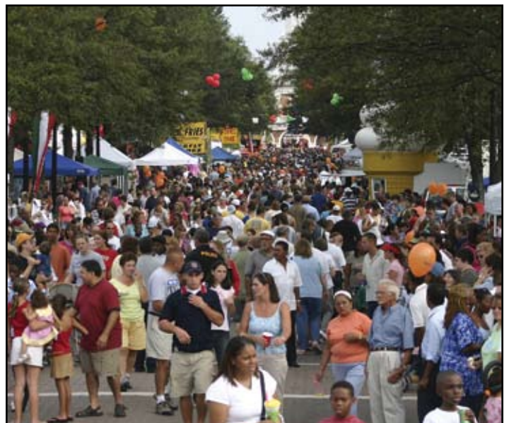
Over 70,000 people attended the 27th Annual International Folk Festival. The Southeast Tourism Society named the festival as one of the Top 20 events in the Southeast.